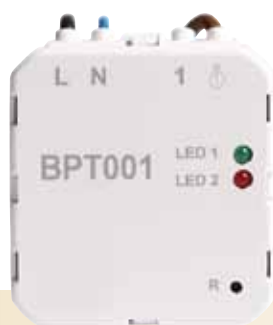
BPT 001 for BPT 710 Flush-mounted receiver Item no.: 11000011