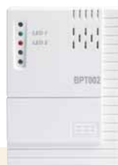
BPT 002 for BPT 710 Wall-mounted receiver Item no.: 11000013