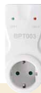
BPT 003 for BPT 710 Socket receiver Item no.: 11000012